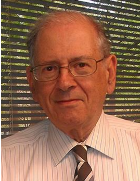
Robert E. Kahn, Ph.D. Corporation for National Research Initiatives Reston, Virginia

For enabling the Internet by developing TCP/IP, the set of methods that allows effective communication between millions of computer networks.